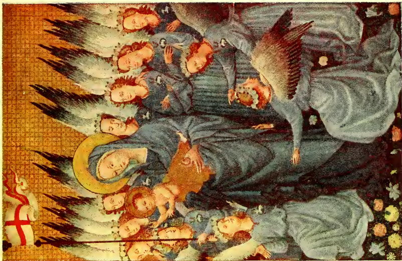
RICHARD II BEFORE THE VIRGIN AND CHILD. From a picture by an unknown artist in the Wilton House Collection.